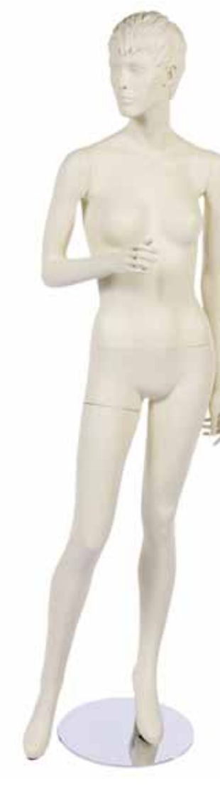
STYLE # - LFM 803