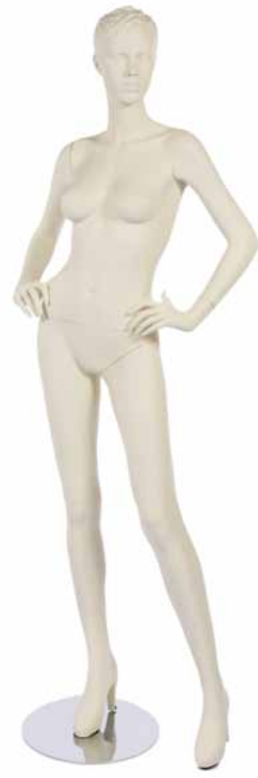
STYLE # - LFM 196