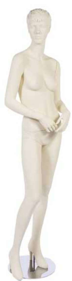
STYLE # - LFM 197