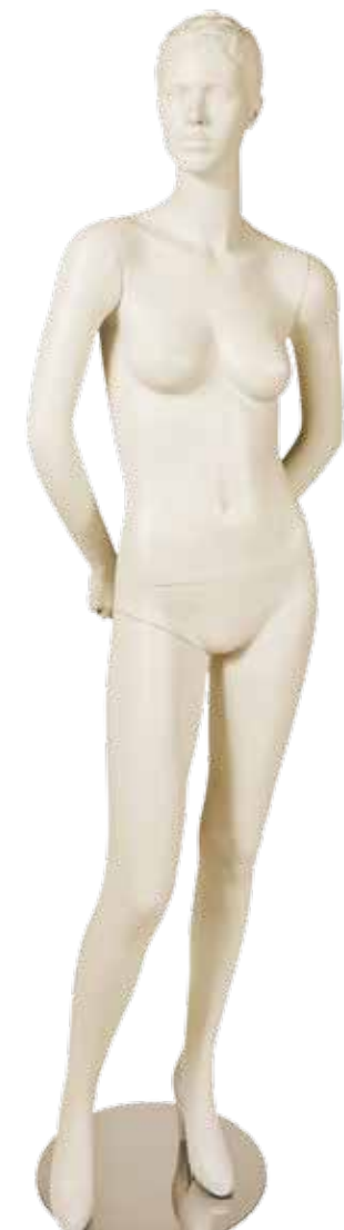
STYLE # - LFM 197-SPE