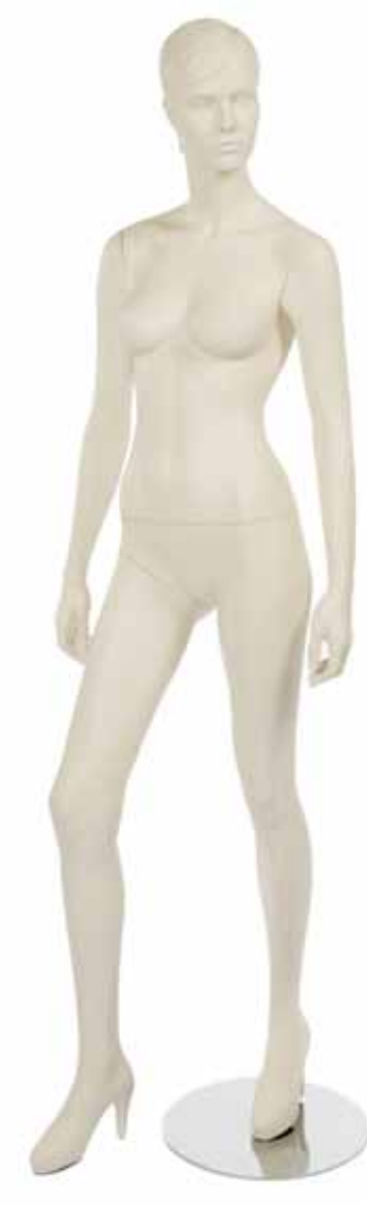
STYLE # - LFM 198