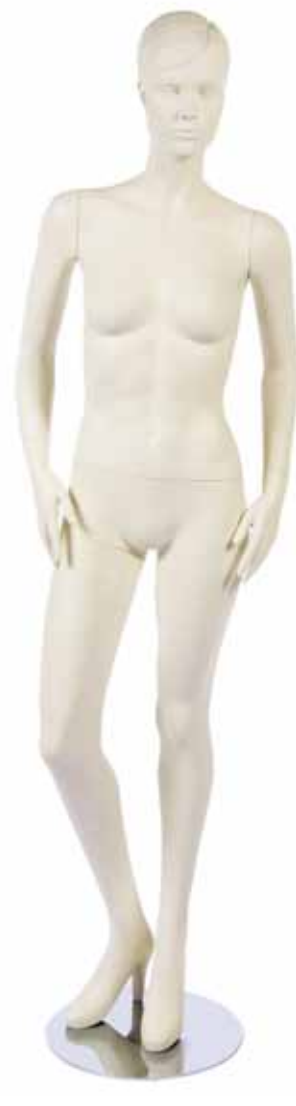
STYLE # - LFM 802