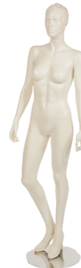
STYLE # - LFM 802-198