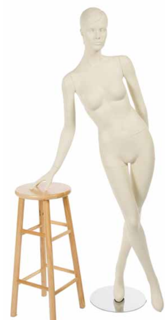
STYLE # - LFM 801